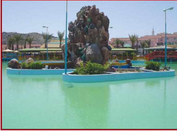
منتزه أرض القمر – الطائف