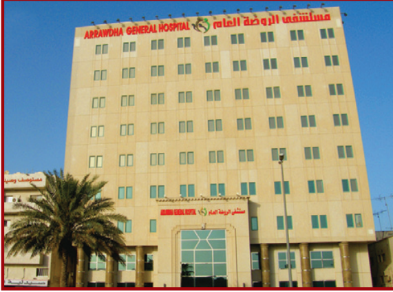
مستشفى الروضة العام – الدمام