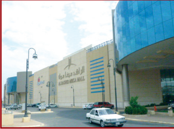
الراشد ميغا مول - المدينة