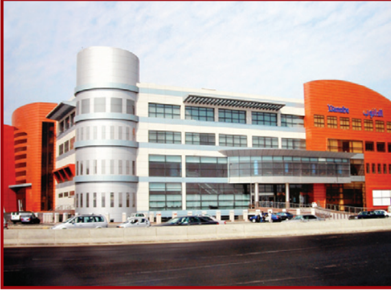
مركز التسوق الدانوب - جدة