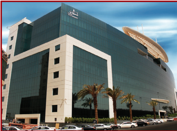
برج التطوير – الرياض