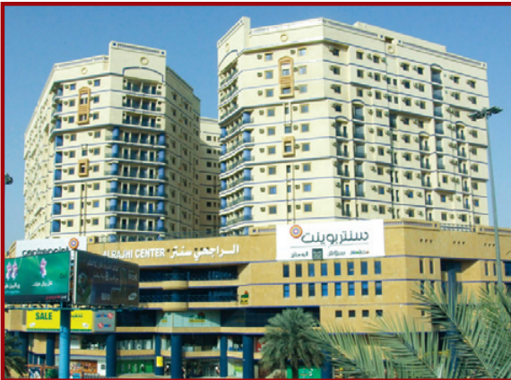
مجمع الراجحي سنتر - مكة