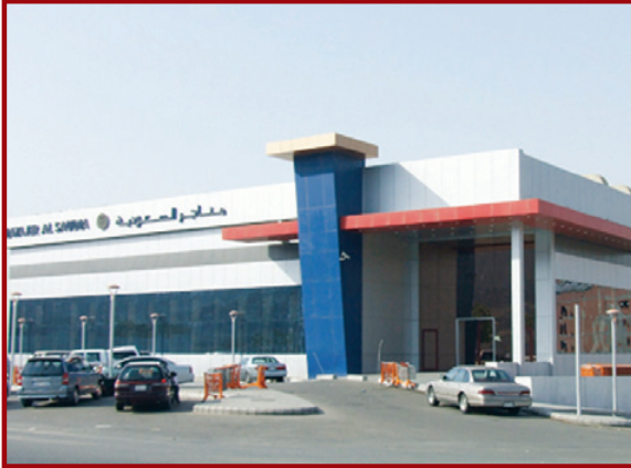
مطبخ السعودية – مكة