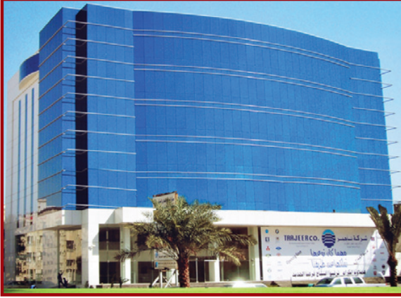
شركة تاجير كو - جدة