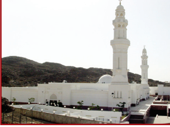
السبع مساجد - المدينة