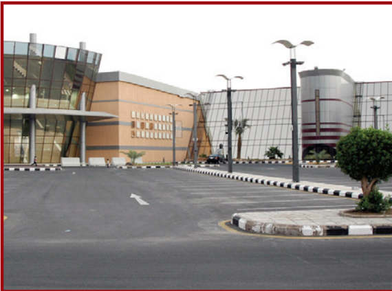
الحسان مول - المدينة