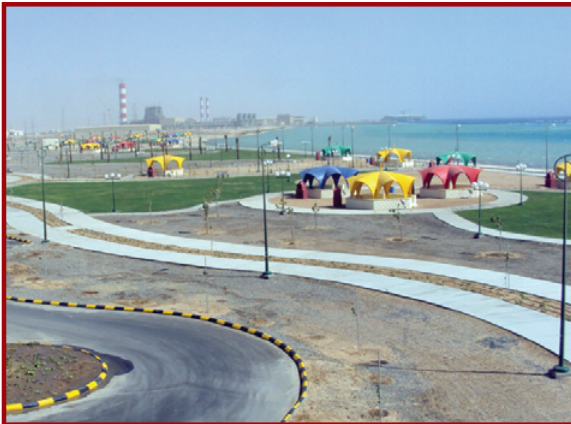
تجميل شاطيء محطة التلية ينبع

Floating Platform for Jubail Port Ras Al Ghar