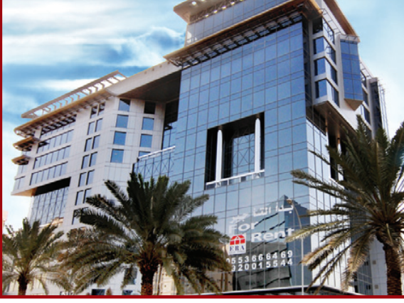
مبنى السبيعي – الرياض