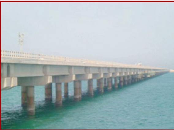
جسر بحري أرامكو – راس الخير