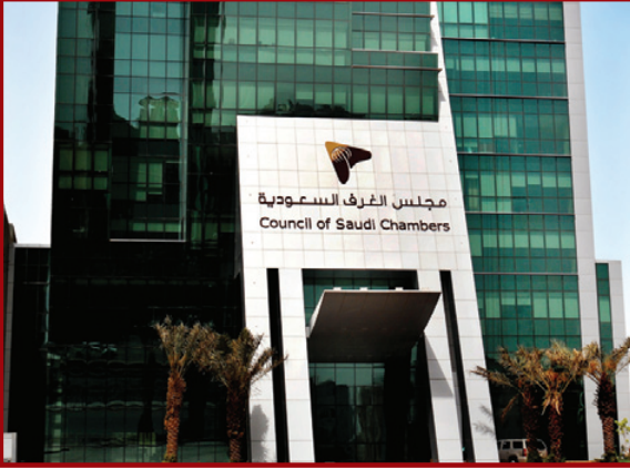
مجلس الغرف السعودية – الرياض