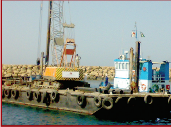
رصيف عائِم بميناء راس الغار الجبيل

Floating Platform for Jubail Port Ras Al Ghar